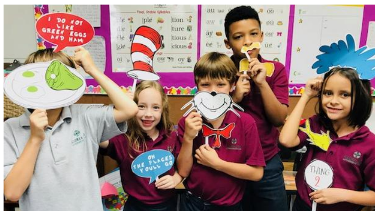
1 st and 2 nd Grade Class